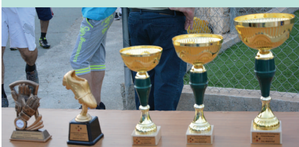
And the Award goes to the team ... Page 7