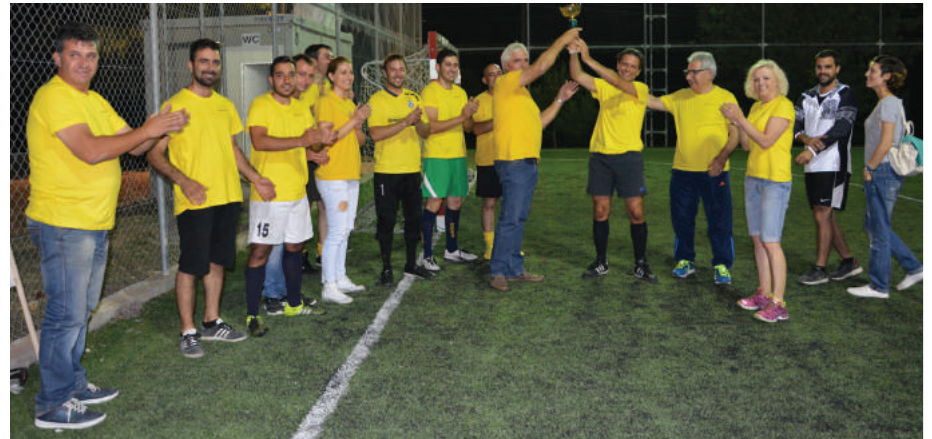
1st Winner: «Falcons»

"Fair play means to have been trained to play fair, play clear, be stable, beware of temptations, show respect for the entire athletic procedure, respect for sports fans and the environment."