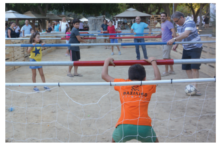
Playing the "Human table football"