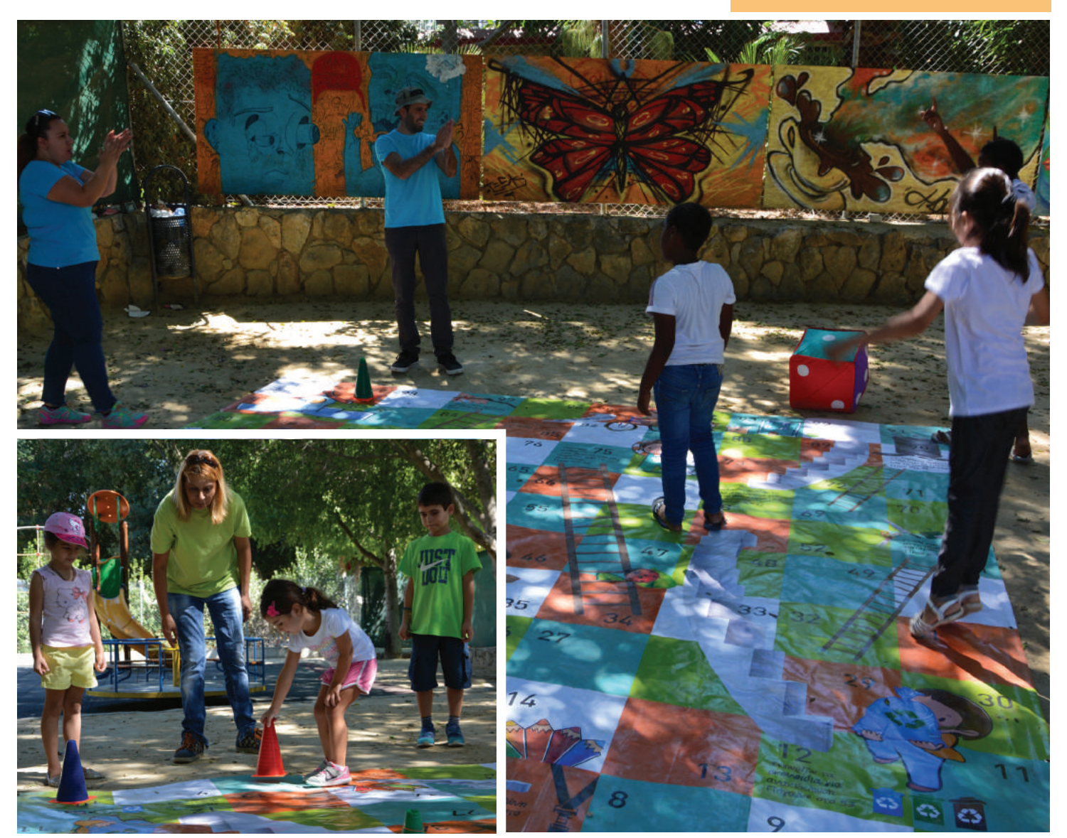
Vassiliko snake game awaited our young friends to offer entertainment